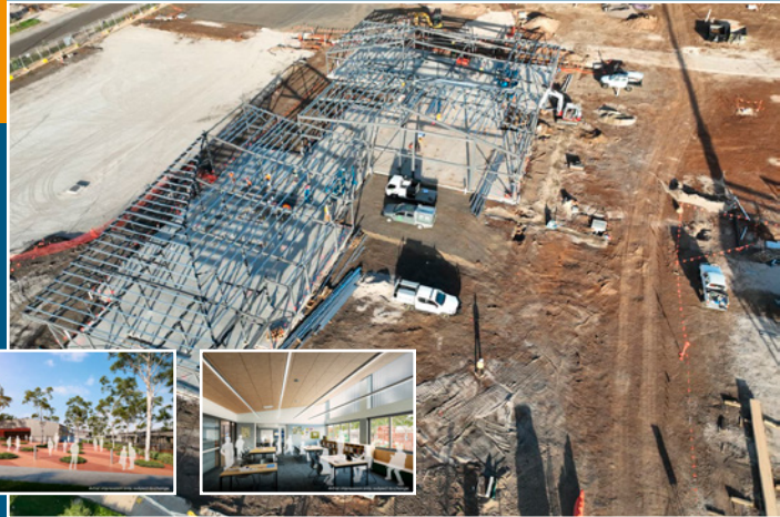
Tarneit North Primary School (interim name)

The 2024 new school zones can now be viewed online at findmyschool.vic.gov.au . And, if you'd like to help choose the final names for any of the three schools, why not visit engage.vic.gov.au and have your say. Following consultation, these are expected to be announced in Term 3, 2023.