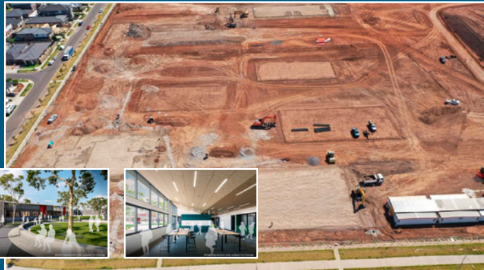
Truganina North Secondary School (interim name)

Images are artist impression only.